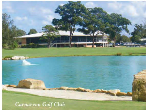
Carnarvon Golf Club

The 2011 Australian Hickory Shaft Championships will be held at Carnarvon Golf Club on 30th November.