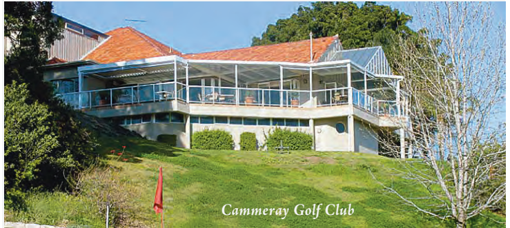
Cammeray Golf Club