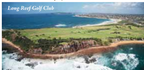
Long Reef Golf Club

Long Reef Golf Club - Anzac Avenue, Collaroy "Dan Cullen" Trophy 2 Ball Ambrose.