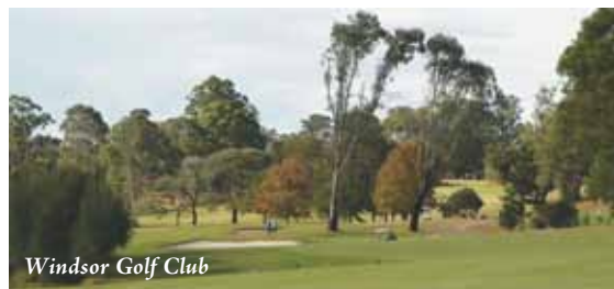
Windsor Golf Club

Windsor Golf Club - McQuade Avenue, Windsor AGHS vs Windsor Vets .