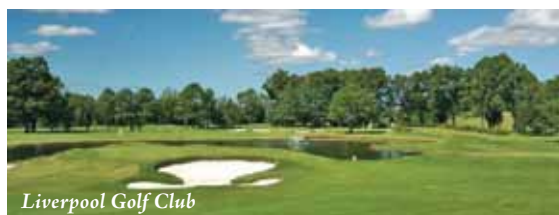
Liverpool Golf Club

Liverpool Golf Club - Hollywood Drive, Lansvale